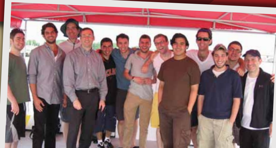
The Rebbeim and talmidim enjoying a trip